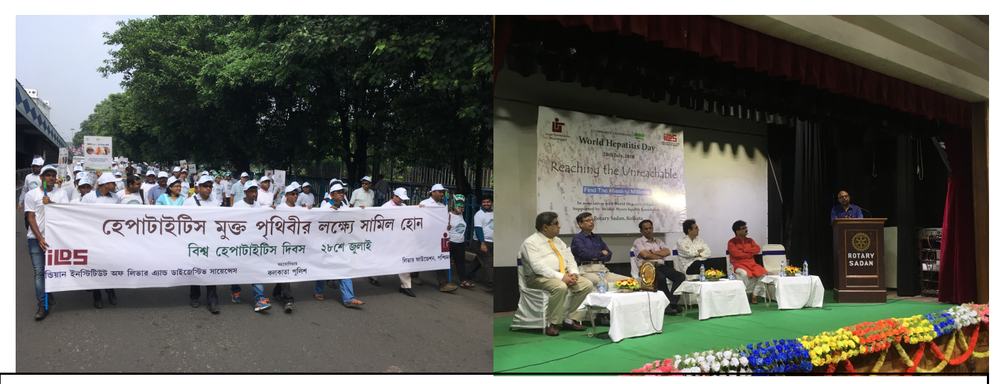
We will also undertake an unprecedented project named "Reaching the Unreachable" to eliminate viral hepatitis. This will be a contributory event to the Test. Treat.

This year also, on world hepatitis day (28<sup>th</sup> July, 2018), we will organize a Hep Hour, an unique event of NoHep program (after the rally) and expecting participation from government, media, artists' forum, members of civil society, students' etc.