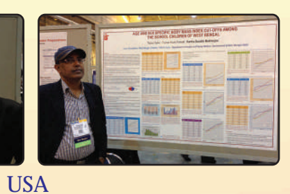
Teteroid health gain by directings a physical soliday session in red correger