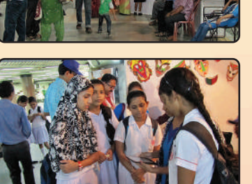
WORLD HEPATITIS DAY